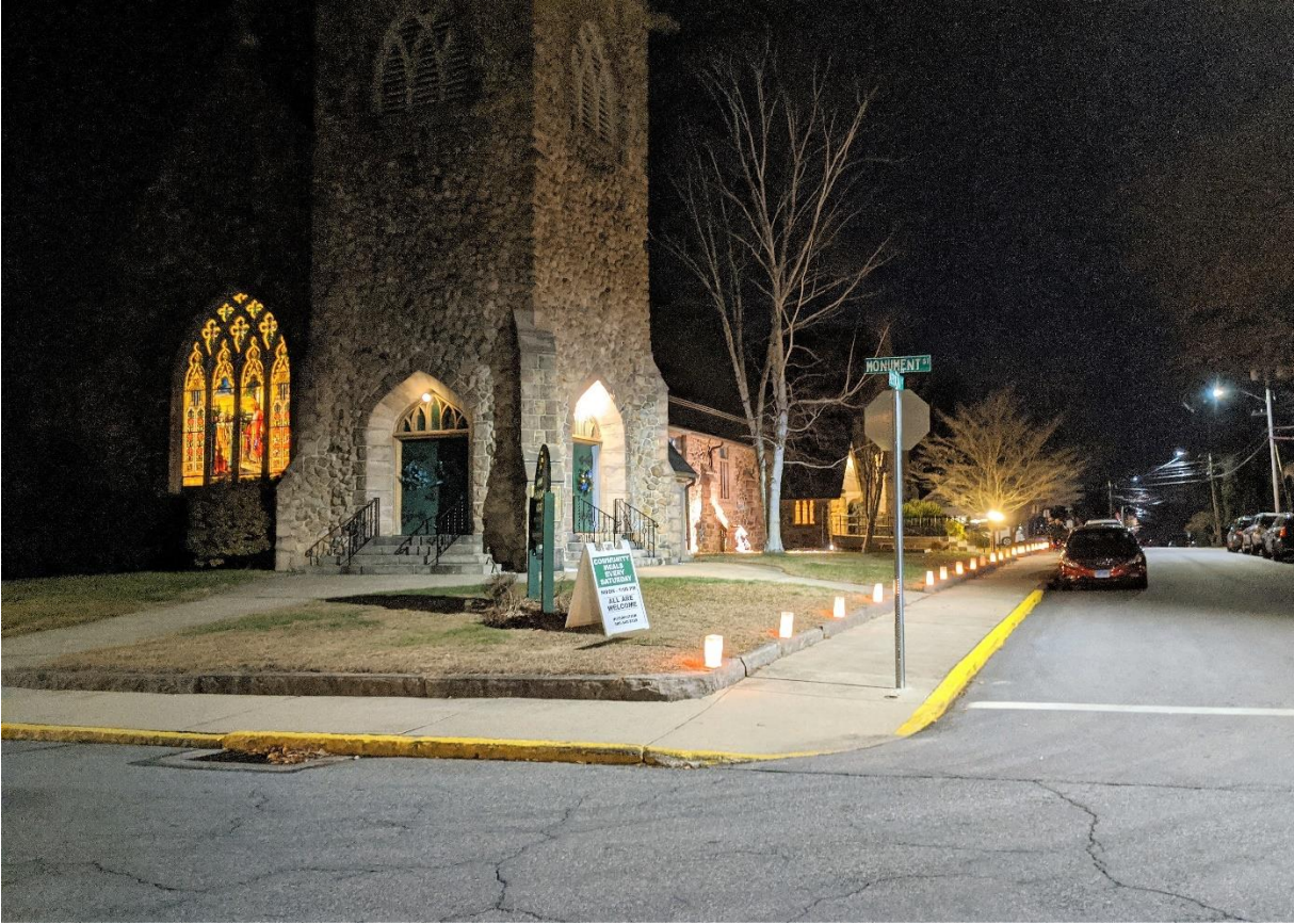
A beautiful picture of our Church for the Christmas Service