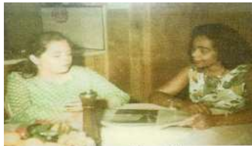
Prudence with Coretta Scott King